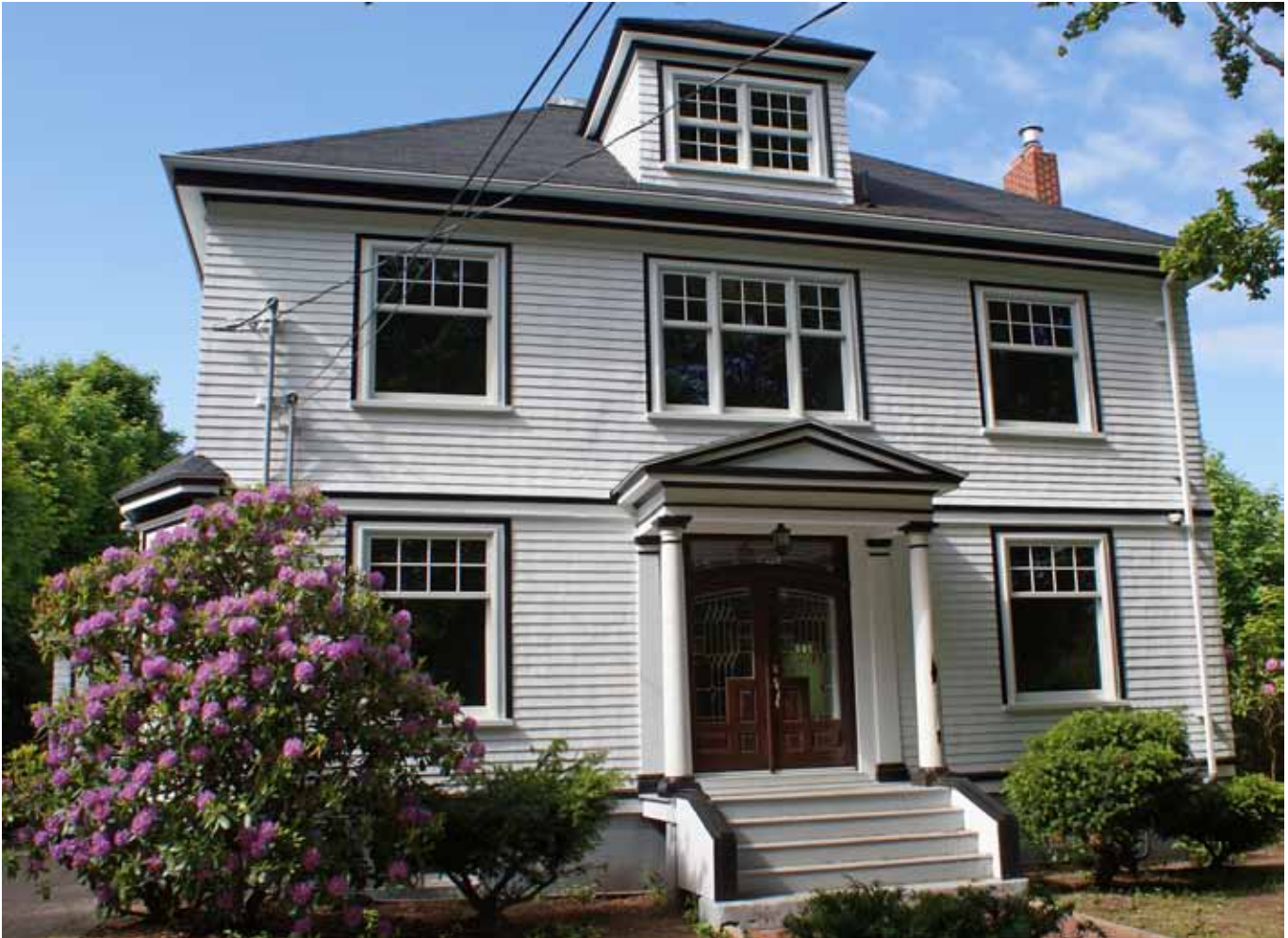
298 Portland Street.