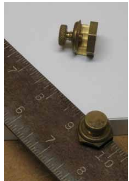
Brass stair gauges can be used while marking angles with a framing square.