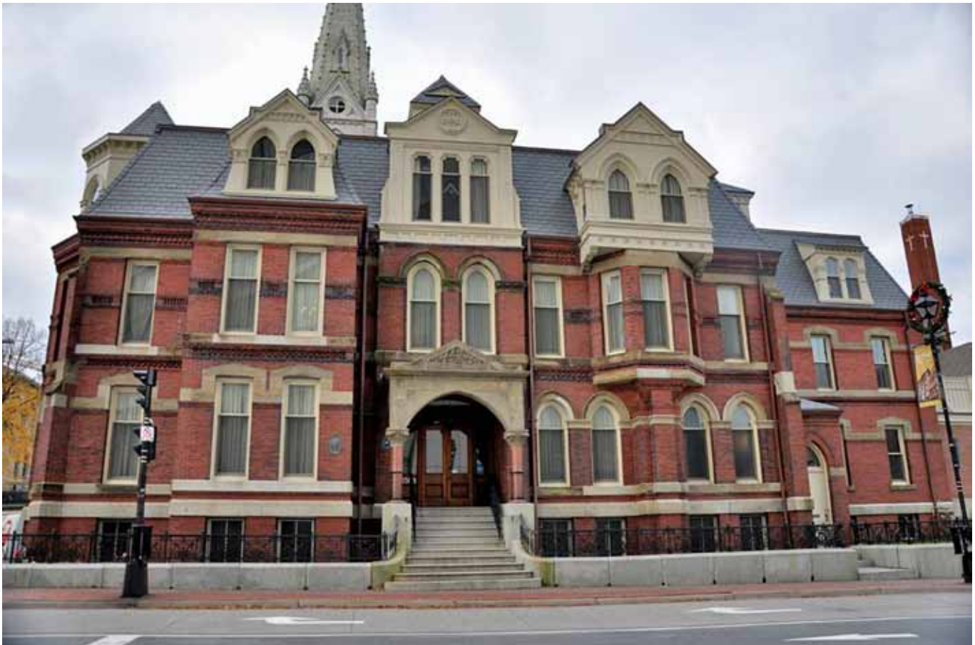
St. Mary's Glebe, 1508 Barrington St., Halifax.