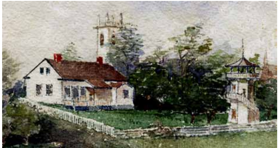
This unsigned watercolour (c. 1910) of the Lightfoot property was used as a reference for the restoration of the tower in the 1980s.