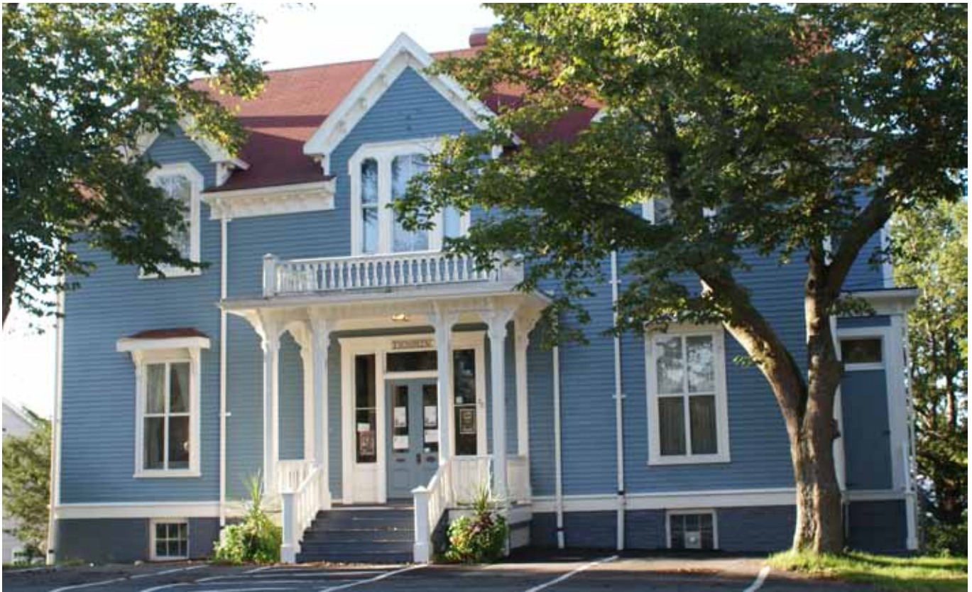
Evergreen at 26 Newcastle Street.

Evergreen and Quaker House are both owned by the Halifax Regional Municipality, and operated by the Dartmouth Heritage Museum Society. Evergreen has been open year-round since the Museum moved its offices there about ten years ago.