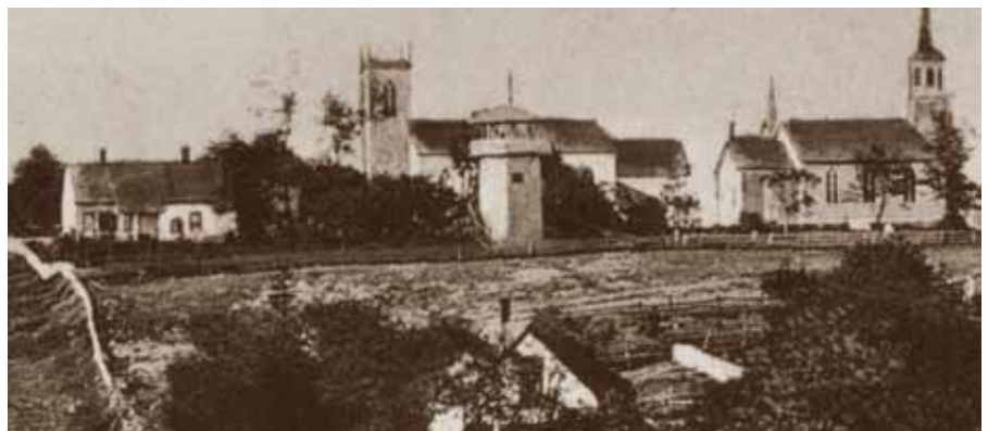
An early photograph of the tower, c. 1910.

Tower, and watch the races in Mahone Bay.