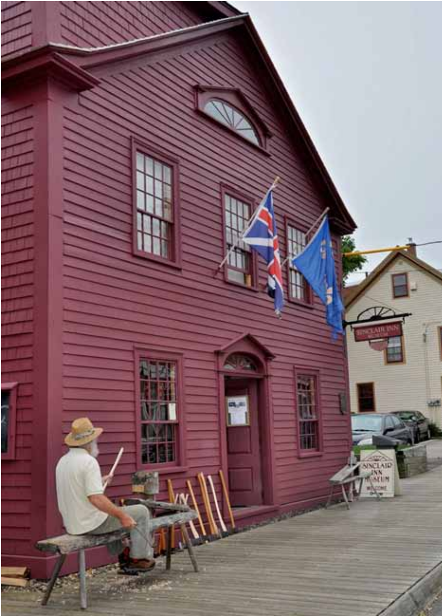
Sinclair Inn Museum, 232 St. George Street, Annapolis Royal.