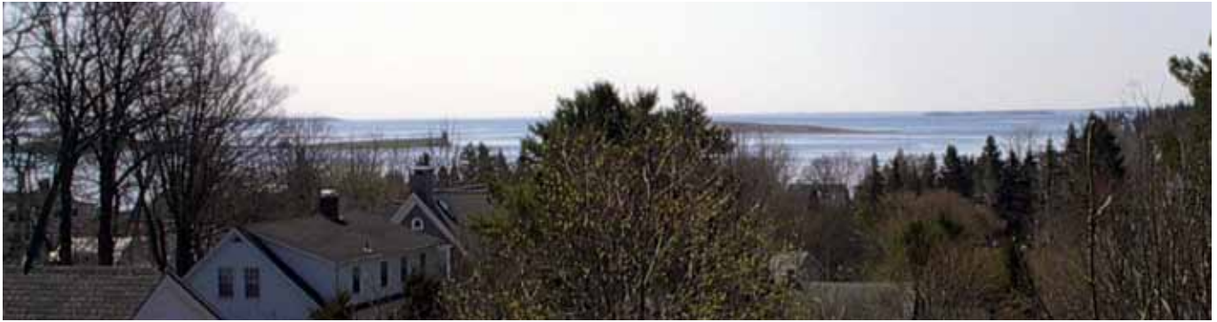
The splendid view from the tower in Spring.