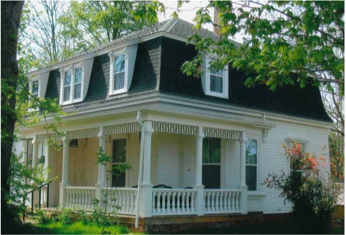
The Rayski House, 211 Old Post Road, Grand Pré.