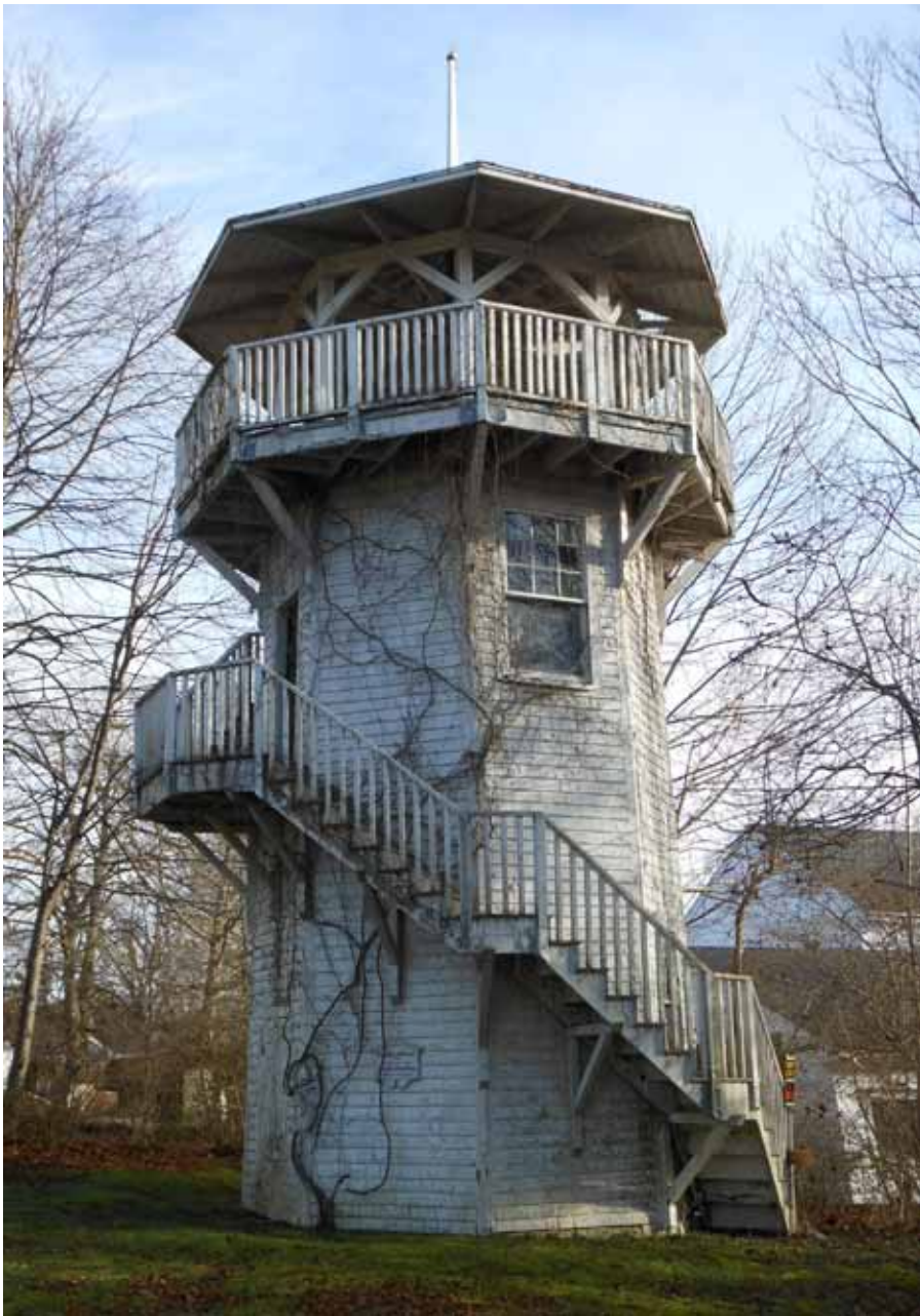
The tower in December 2012.

is sustained by a modest endowment fund and private donations; however, it has never had the resources to maintain the adjacent Tower. Subsequently, the Tower stairs rotted away, and the basic shell remained untouched until the Chester Municipal Heritage Society got involved in the mid 1980's.