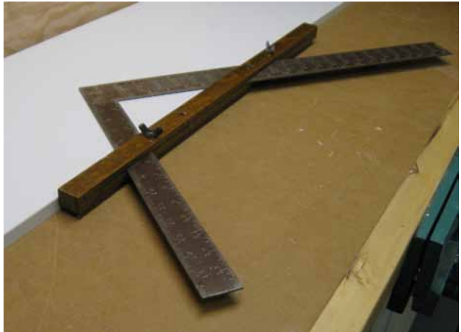
A square fence clamped on a framing square to mark a stair stringer with seven-inch risers and ten-inch treads. The oak square fence seen here is over seventy years old and belonged to the author's grandfather, carpenter Joe Macnab.

The square is impressive, but a traditional homemade device makes it even better. A "square fence" is made from a piece of hardwood with a slot cut down the center. The square fits inside the slot and two bolts with wing nuts clamp the square tightly in position at the precise angle. Caution: making a square fence can be a dangerous operation. Tool stores sell alternative gadgets called