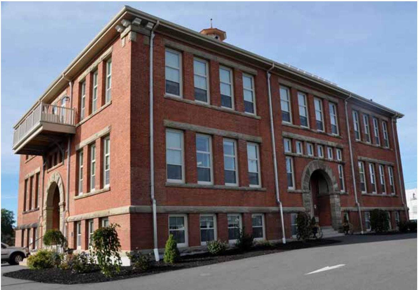
Willow Lofts, 18 Willow St., Truro.