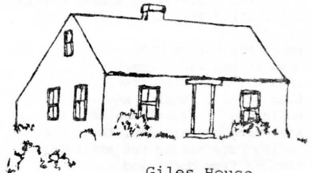
Giles House 1804