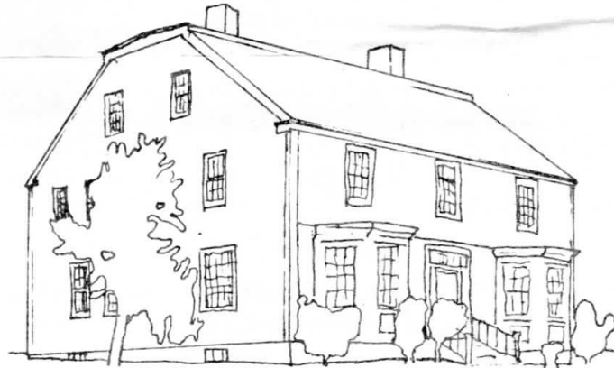
Heritage Trust House